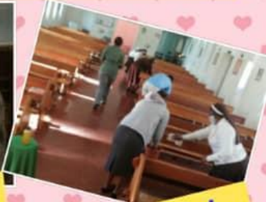
Sanitizing the Church