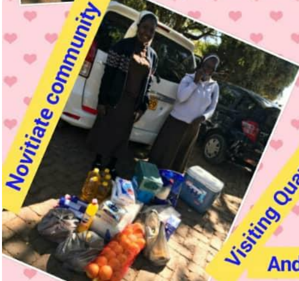
Visiting Quarantine places And poor homes