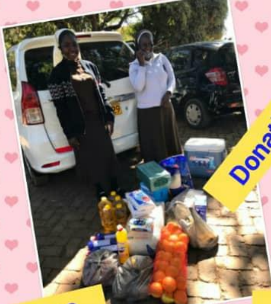
Donation in kind

We have been involved in different activities during COVID19 pandemic such as visiting the poor people's homes and the COVID19 Centres. On behalf of the congregation we have donated food and other bits in kind. We feel this is an opportunity for us to expand our Franciscan hearts.