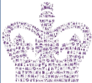
The Queen's Award for Voluntary Service