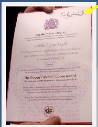
Certificate signed by the Queen