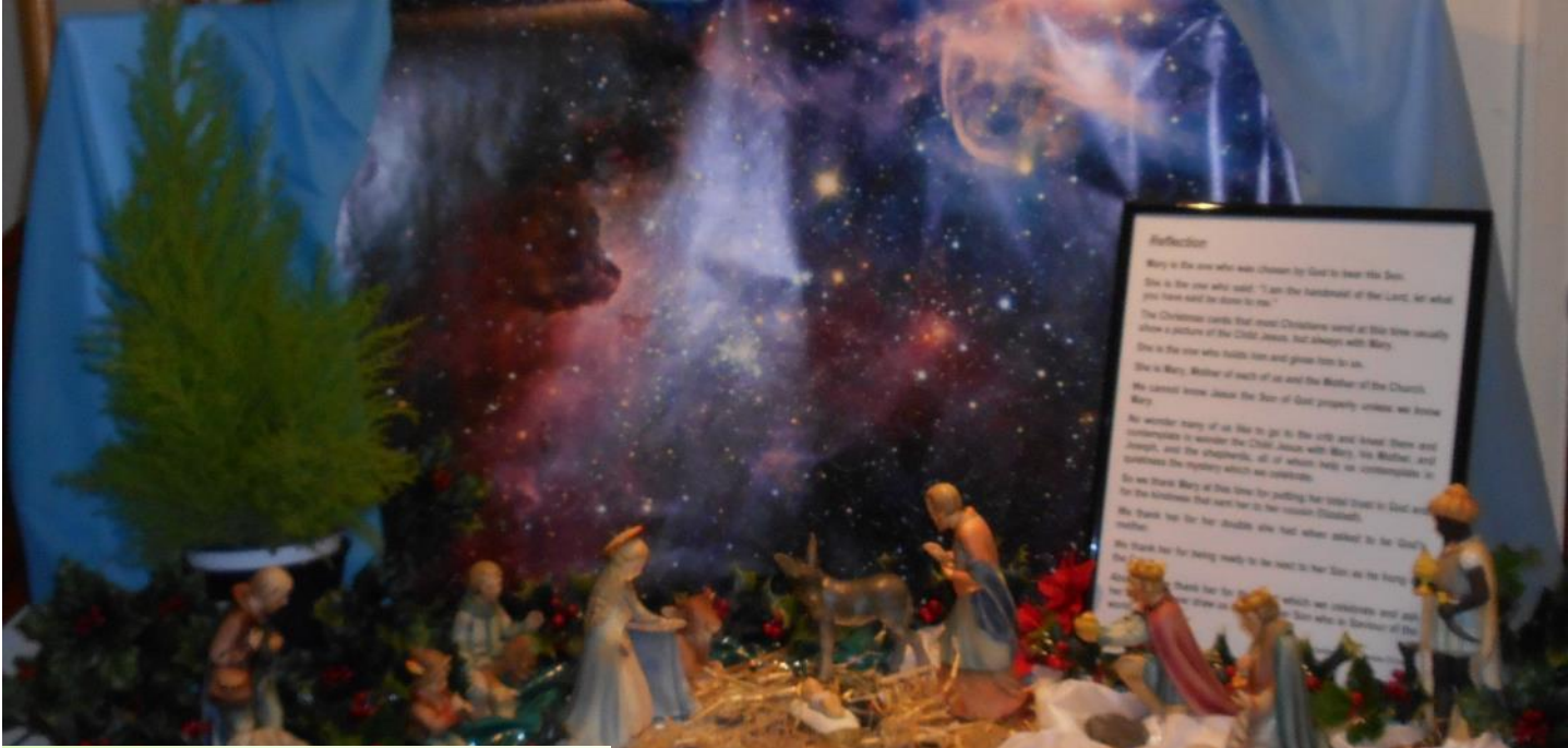
A Christmas Crib Reflection at La Verna

CHRISTMAS CAROL “How silently, how silently, the wondrous gift is given! So God imparts to human hearts the blessings of His heaven. No ear may hear His coming, but in this world of sin, Where meek souls will receive Him still, the dear Christ enters in.”