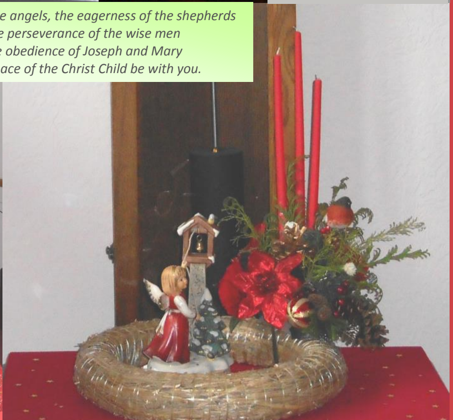
Christmas decorations around Ladywell house