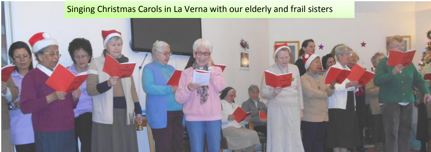
Singing Christmas Carols in La Verna with our elderly and frail sisters