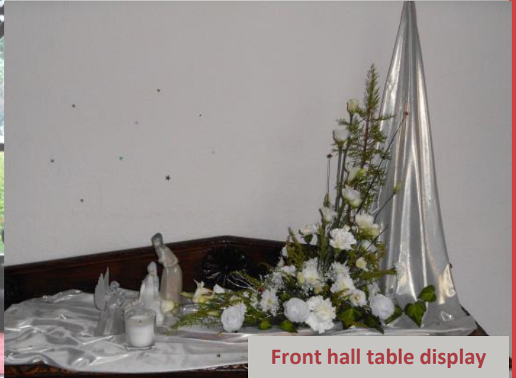
Front hall table display

The joy of the angels, the eagerness of the shepherds The perseverance of the wise men The obedience of Joseph and Mary The peace of the Christ Child be with you.