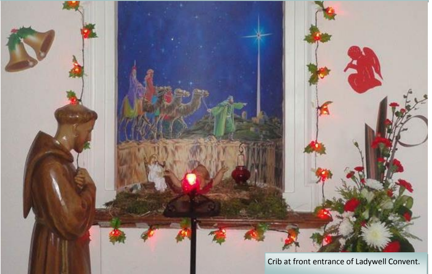
Crib at front entrance of Ladywell Convent.

St Francis used to observe the Nativity of the Child Jesus with an immense eagerness above all other solemnities, affirming it was the Feast of Feasts, when God was made a little child. (2C 199)