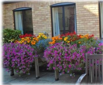
Sr Hazel's Flower beds