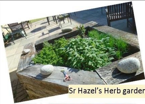
Sr Hazel's Herb garden