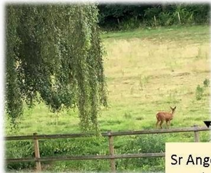
Sr Angeline Lim saw from her window in LV a deer chasing a fox chasing a rabbit...