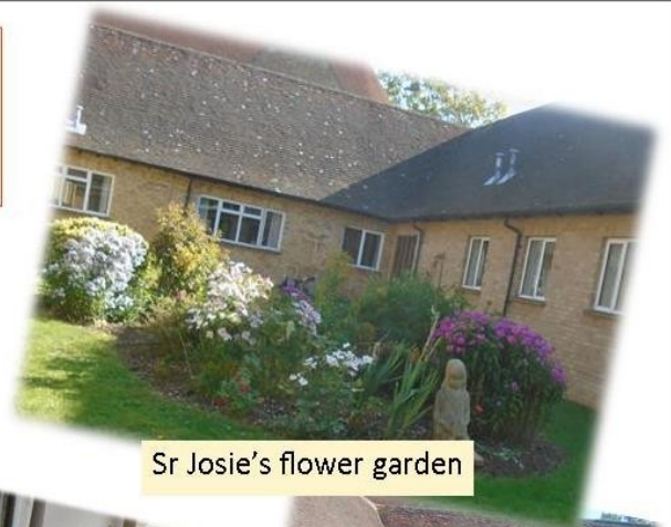
Sr Josie's flower garden