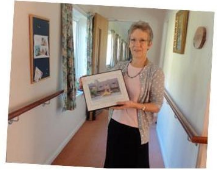
Scilla with a framed photo of Ladywell