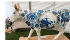
Blue Cow Bone China