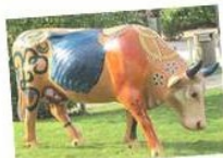
Pilgrim - Inspired by Watts Gallery