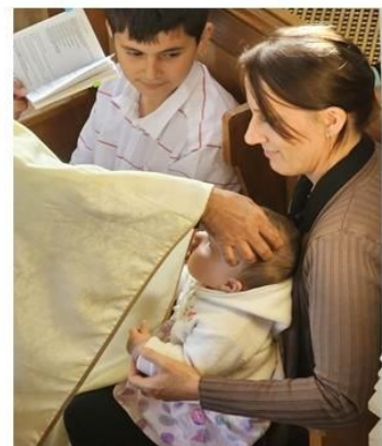
A tiny child is anointed watched by her big brother!