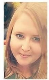
Abbie Barr Purchase Ledger

We all look forward to meeting you around Ladywell when Covid restrictions are lifted. We do hope you will be happy working here.