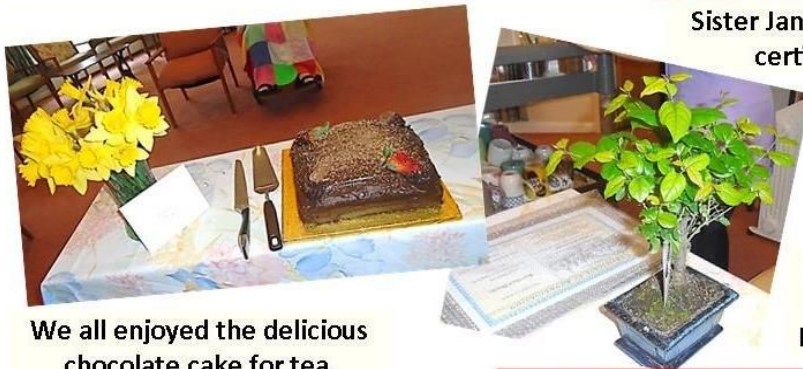
We all enjoyed the delicious chocolate cake for tea.