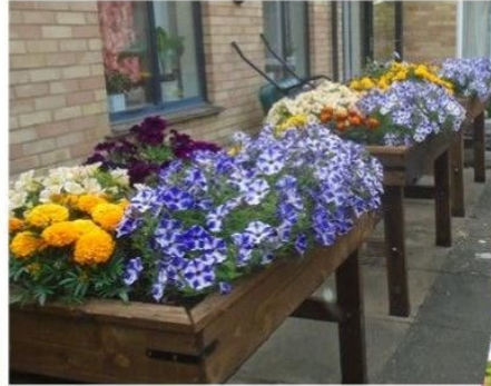
Sr Hazel Buckley tends this inner bright garden with some sweet peas just beginning to bloom.