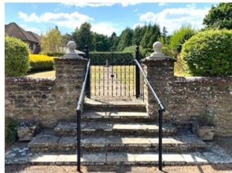
The wrought iron gate and railings leading to the sunken garden have been beautifully painted shiny black by Jake Horton and the hedges shaped by Terry Welland

News, Views and Photos for everyone in Ladywell