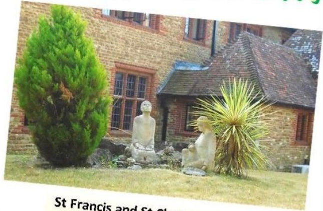
St Francis and St Clare prayerfully set the scene as we enter Ladywell