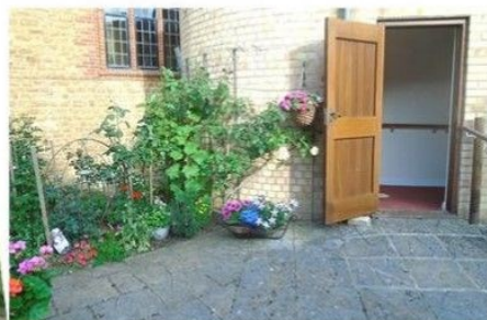
Sr Mary Burke has a very, peaceful colourful garden between the Main Chapel and La Verna Chapel