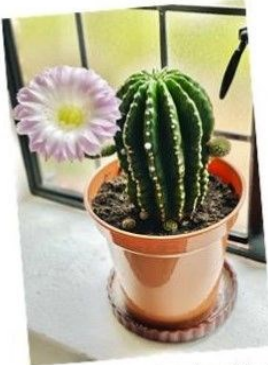
This special Cactus lives in St Clare's laundry, is tended by Sr Maureen, only blooms for 24 hrs. Paolo Cafiero captured it beautifully.