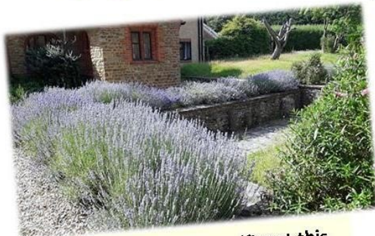
The Lavender is magnificent this year in the Sunken Garden