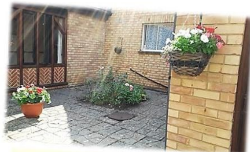
Peaceful inner garden by L.V. Chapel