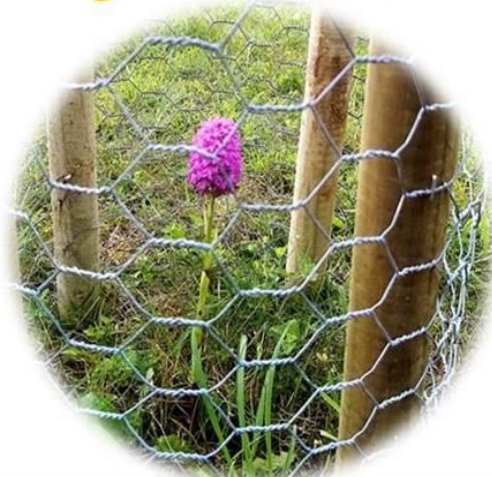
THIS CURIOUS PYRAMIDAL ORCHID APPEARED ON THE MOUND OUTSIDE LA VERNA FRONT DOOR, CAPTURED AND PROTECTED BY TERRY WELLAND