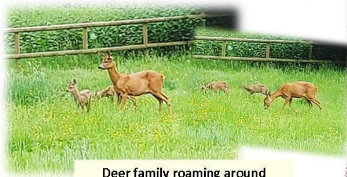
Deer family roaming around

News, Views and Photos for Everyone in Ladywell