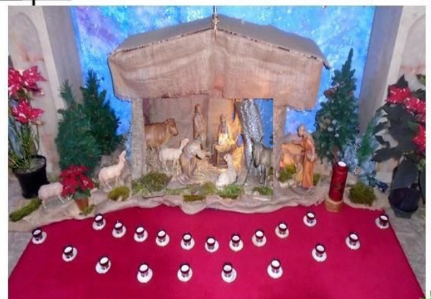
The Christmas Crib in Ladywell Chapel with candles representing each one of our staff, which will be lit during our services. We will pray for all of you and your families in thanksgiving for all you do for us.