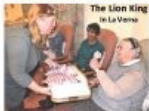
The Lion King in La Verne