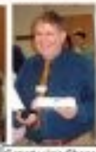
Sr. Rose wine Chocs