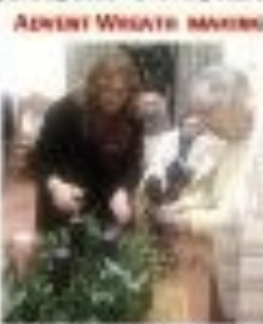
ADVENT WREATH MAKING