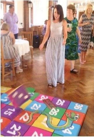
Dawn was an all-rounder