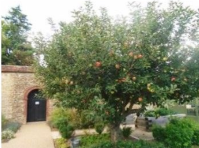
The Pink Lady trees survived all the excavations in the Carceri Garden