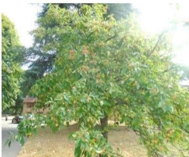
The Crab apple tree looks good this year