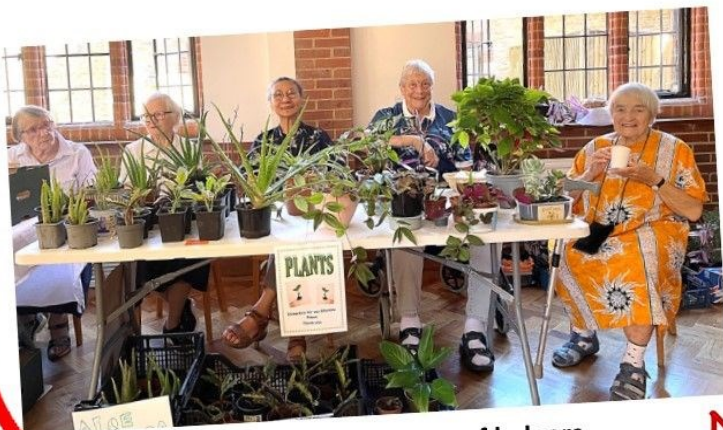
The plant stall had plenty of helpers.