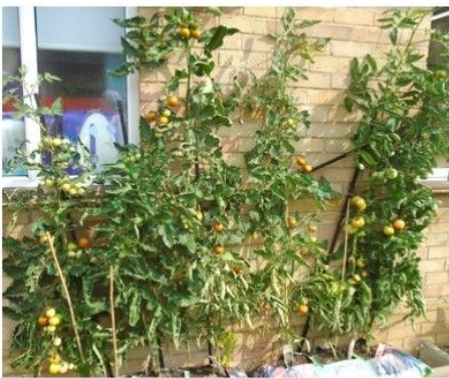
Sr Hazel planted tomatoes in her inner garden