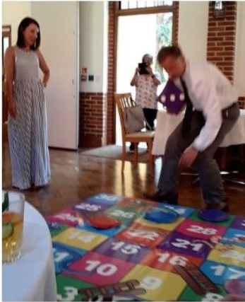
Giant snakes and Ladders