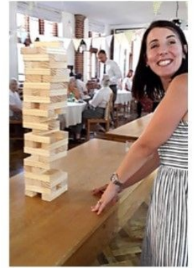
The most difficult game, it seems was the Giant Jeng, especially when we heard a great crash of falling wood.