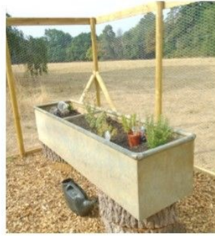
Sr Caroline Granil has a herb garden planted in the old horse troughs opposite La Verna kitchen