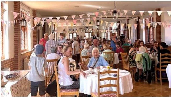
In no time at all the refectory was full of people enjoying the social event.