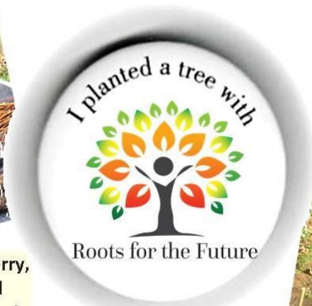
The children received badges for helping.