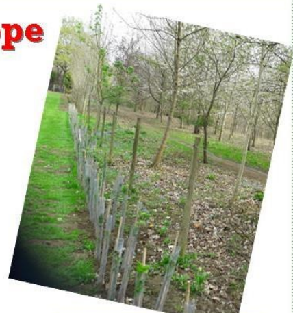
After 4 weeks the hedge is sprouting out over the protective covers.