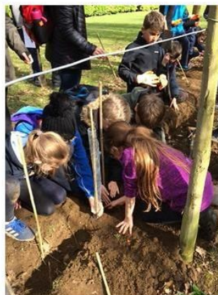
The children working hard in the field.