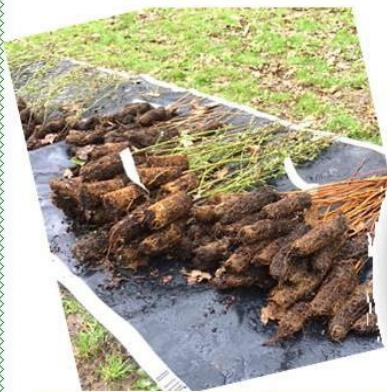
Roots of Dogrose, Birch Cherry, Plum Cherry, Rowan and Spindle beautifully prepared for planting

We all thank "Roots for the Future" for beautifying our ancient Shrine.