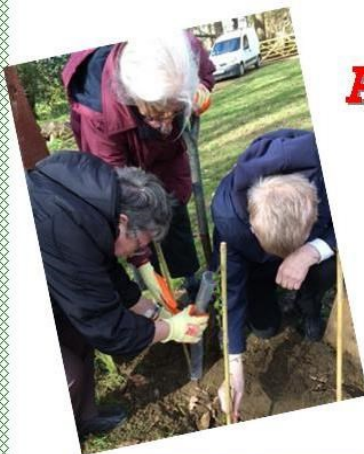
Sisters lend a hand too.