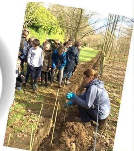
Children from St Edmunds Primary School watch attentively as they are shown how to plant a hedge.