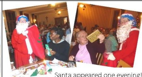
Santa appeared one evening!