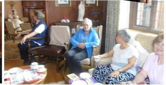
St Clare's had a coffee morning with all the trimmings.