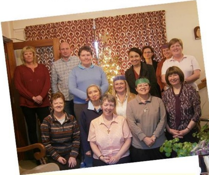
St Francis staff enjoyed a Christmas Lunch.