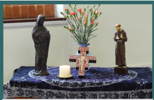
Prayer space in the Chapter Room