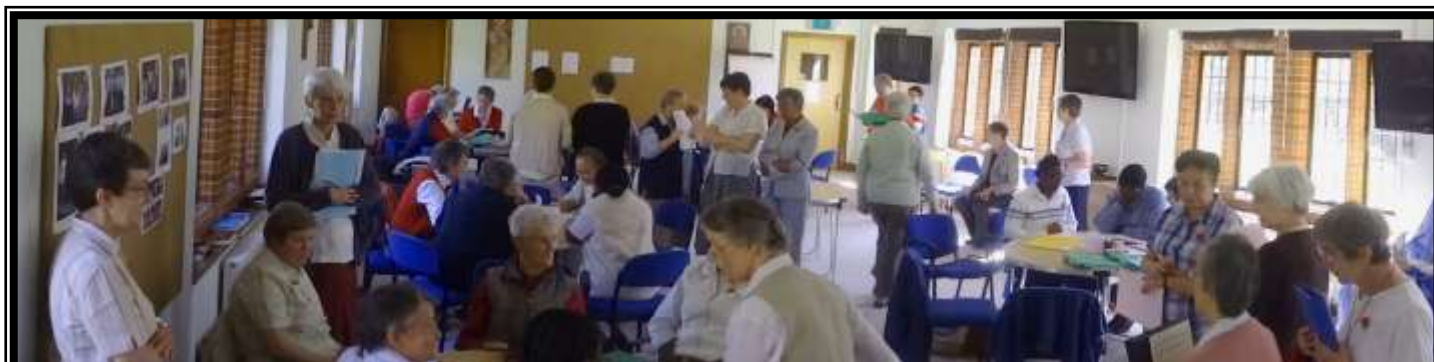
Gathering information to get a sense of where the Spirit is calling the Congregation at this time.

Different table groups had prepared draft statements capturing something of the different calls from the Congregation. Each table then looked at all the different statements and discussed their responses and made suggestions for changes. Members then engaged in a lively process whereby two table group members “stayed at home” to receive comments and suggestions from each of the other tables, whilst the rest of the table group went to visit other tables taking the suggestions and comments from their “home” table. Once all the suggestions and comments had been received the table group re-convened to write a second draft of where the Spirit is calling the Congregation at this time.