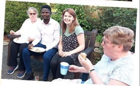
SHARING A MEAL IN THE POOR CLARES MONASTERY GARDEN