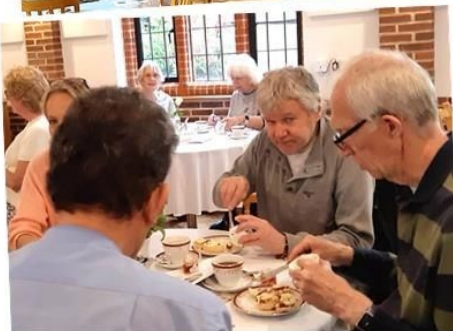
The Cream Teas were so delicious