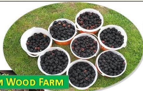
8 containers of cultivated blackberries