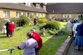
The hunt begins..