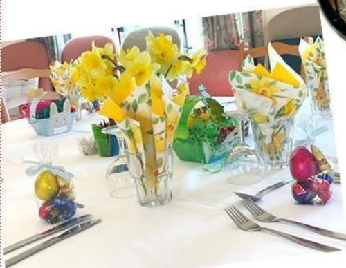
Tasteful Table Settings