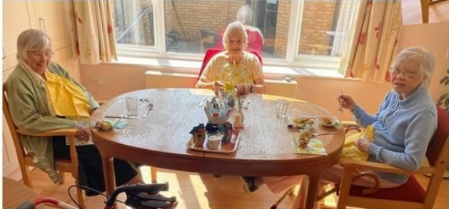
La Verna Sisters in the Dining Room