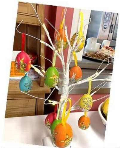
A Pretty Easter Egg Tree

Thank You Everyone For a Very Beautiful Easter Sunday Celebration