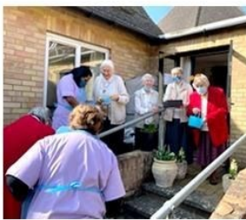
Everyone found something..