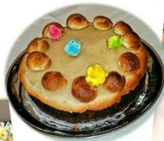
A Gorgeous Simnel Cake