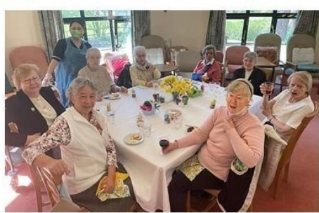
St Clare's Sisters in the Community Room