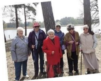
Frensham Ponds were chosen to listen for the cuckoo