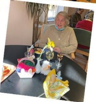
Thank you to Chefs and all our staff who made it so special for us.