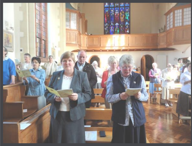
FMDM Sisters, family members at the Silver Jubilee Eucharistic Celebration in Ladywell Chapel Motherhouse, ENGLAND.