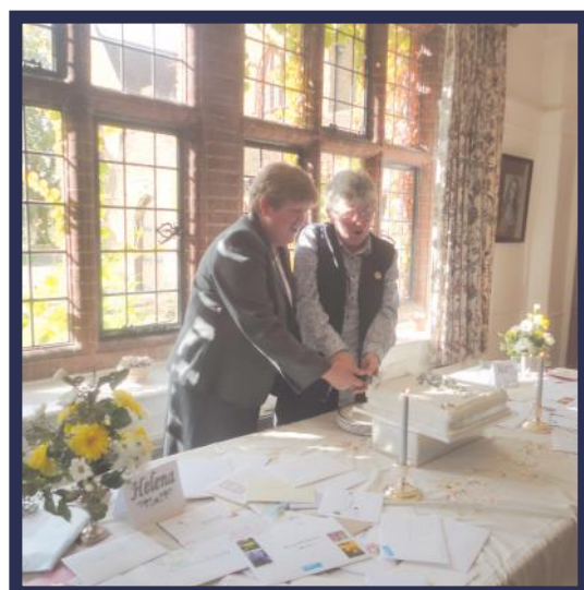
Jubilarians cutting the cake in unison!