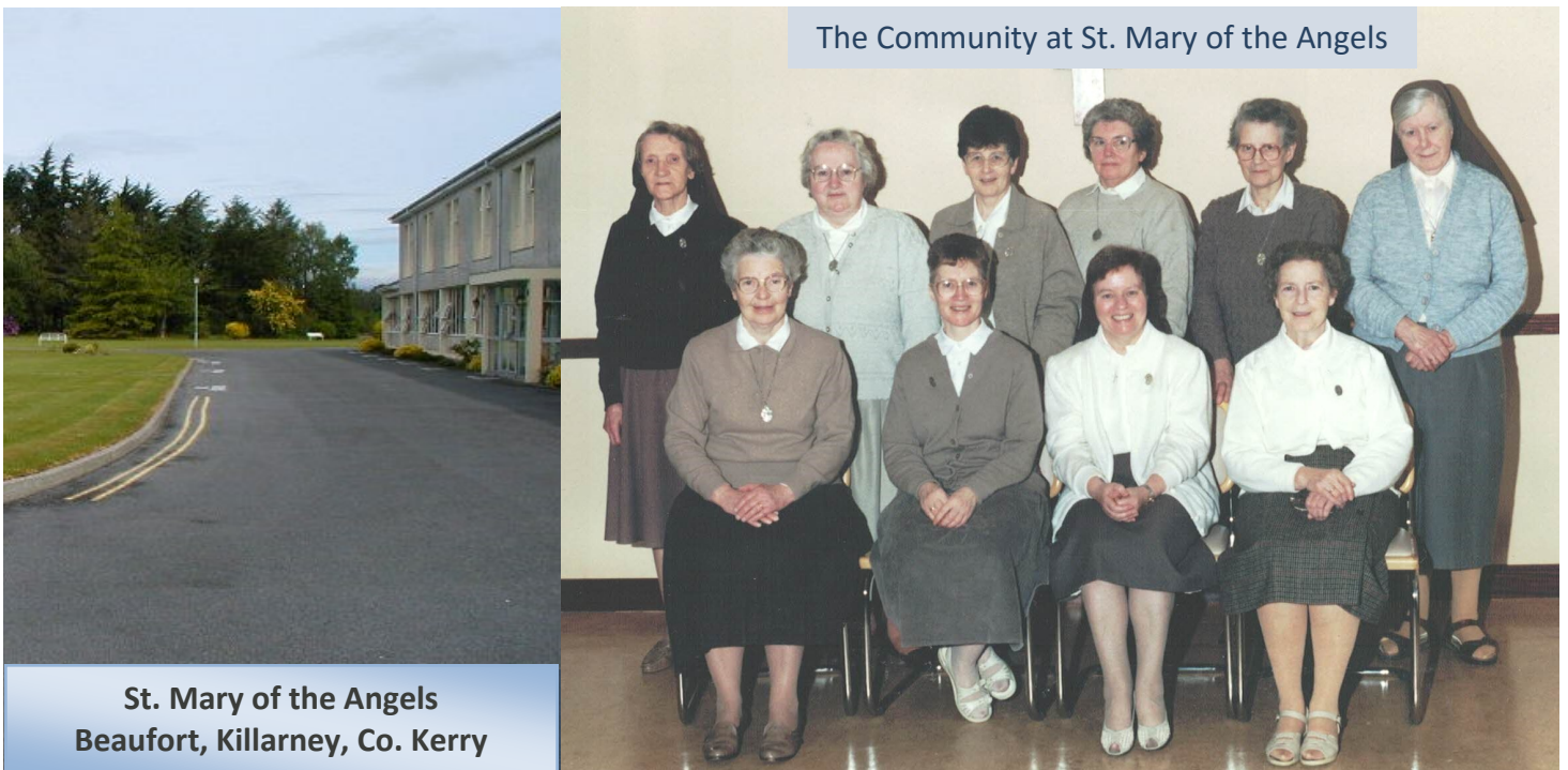
St. Mary of the Angels Beaufort, Killarney, Co. Kerry